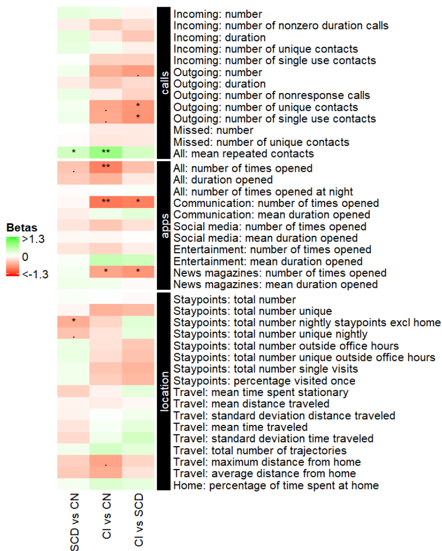
Figure 1. Differences in Behapp outcomes between the 3 diagnostic groups (cognitively impaired [CI], subjective cognitive decline [SCD], and cognitively normal [CN]) participants. Green squares indicate that the first mentioned group shows on average higher values on that Behapp outcomes than the second mentioned group. Red squares indicate that the first mentioned group shows on average lower values on that Behapp outcome than the second mentioned group. All analyses are corrected for age, sex, and education (ie, Behapp outcome ~ diagnostic group + age + sex + education). ** indicates P < .01 ; * indicates P < .05 ; . indicates P < .10 , after correction for multiple comparisons. SCD: subjective cognitive decline; CN: cognitively normal; CI: cognitively impaired.